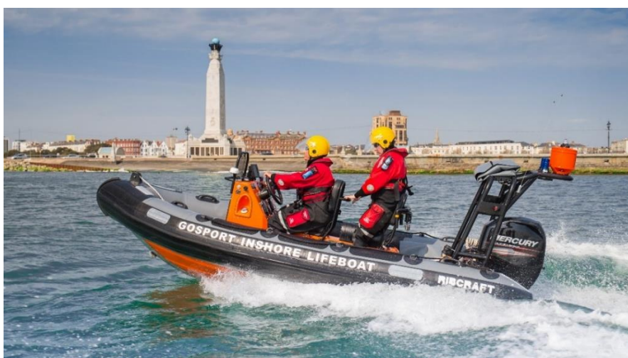
Gosport Inshore Lifeboat, the Ian Fuller, on patrol off Southsea.

As part of our strategic management process to maintain our enduring capability and continuity of service, we conduct regular reviews of our boats and vehicles to ensure they remain fit for purpose and to enable us to plan for their timely replacement.