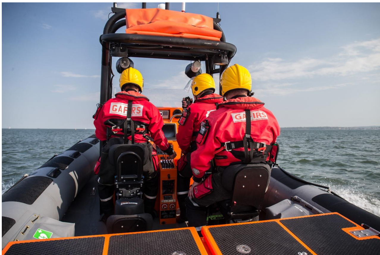
Gosport Lifeboat on patrol in the Solent.